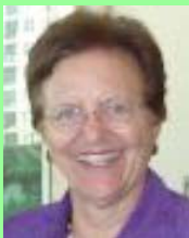
Jan Platt Former County Commissioner

PLACE: Maestro's, Tampa Bay Performing Arts Center