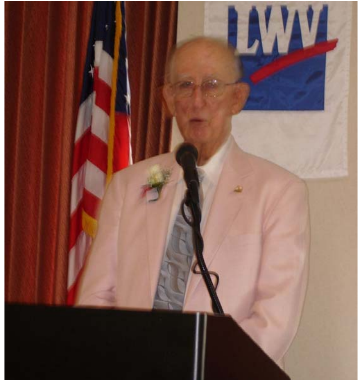
Congressman Sam Gibbons Received the League's Lifetime Achievement Award at a Luncheon at the Centre Club on March 9th.